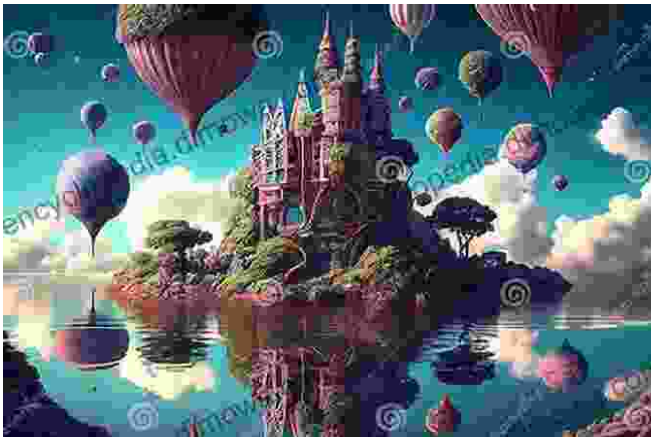
The Alien Next Door 1: The New Kid by A.I. Newton

Escape into a world where anything is possible and the bonds of friendship defy the stars. Free Download your copy of "The Alien Next Door: The New Kid" today and prepare yourself for an unforgettable literary experience.