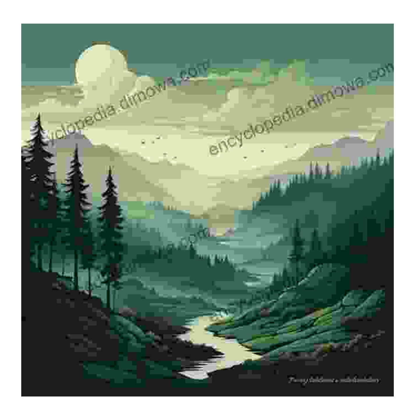
A Tapestry of Seasons, Woven with Words