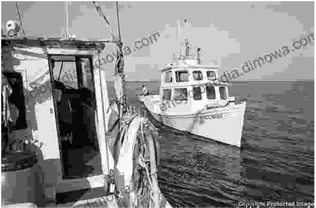
A shrimp boat on Core Sound