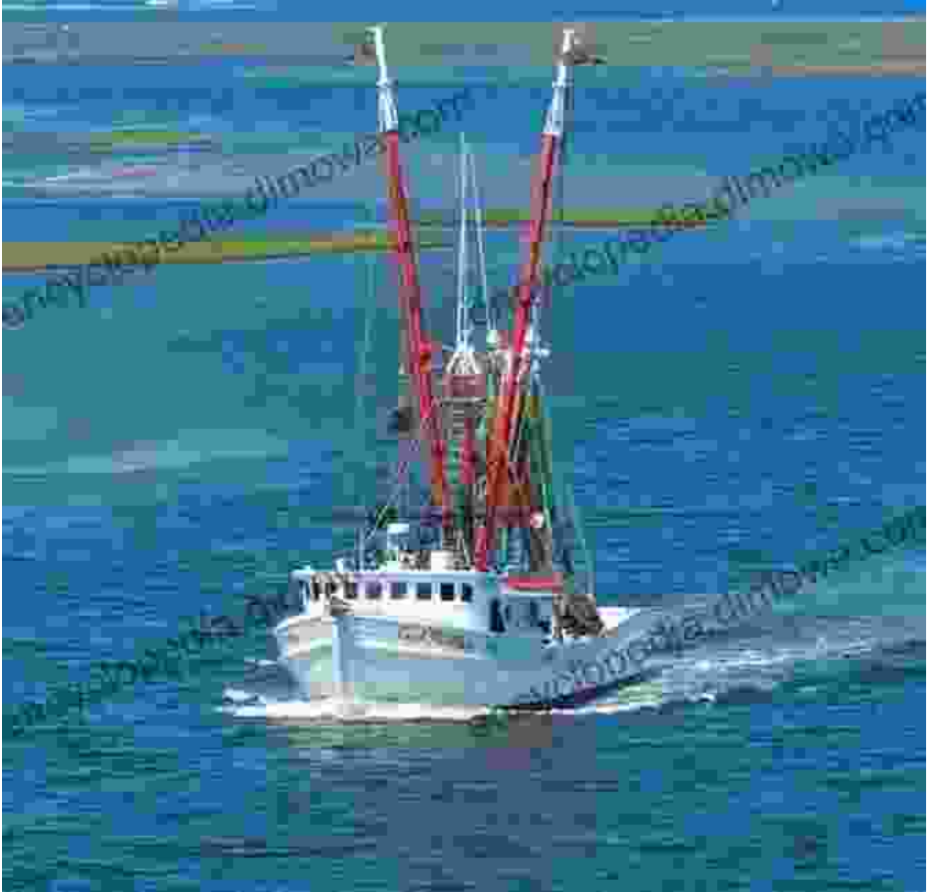
A workboat on the Pamlico Sound